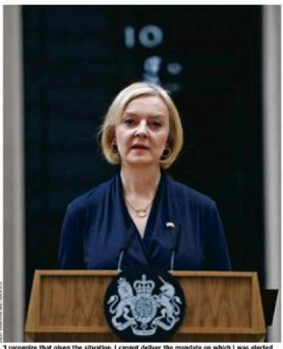
"I recognize that given the situation, I cannot deliver the mandate on which I was elected by the Conservative Party," said U.K. Prime Minister Liz Truss in resigning on Thursday.