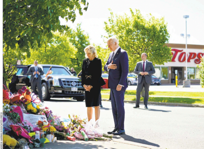
PAYING RESPECTS: President Biden and first lady Jill Biden visit a memorial outside the supermarket in Buffalo, N.Y., where a gunman killed 10 people on Saturday. The shooter's diary shows his descent into racist extremism. A6