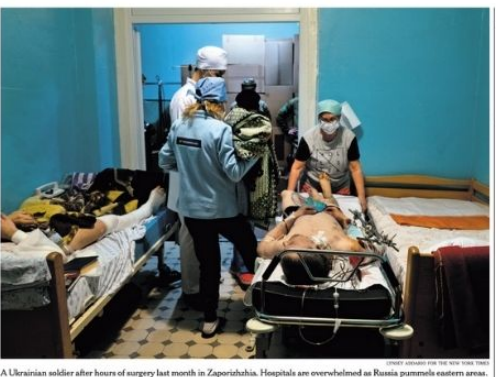
A Ukrainian soldier after hours of surgery last month in Zaporizhzhia. Hospitals are overwhelmed as Russia pushes eastern areas.