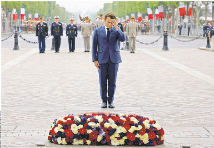
HEROES REMEMBERED: French President Emmanuel Macron stood before a wreath of flowers at the Tomb of the Unknown Soldier under the Arc de Triomphe in Paris Sunday, marking the 77th anniversary of the end of World War II in Europe.