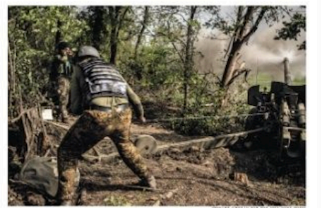
A Ukrainian artillery team in Donetsk exchanged fire with Russian forces four miles away.

By CARLOTTA GALL BAKHMUT, Ukraine — The volunteers listened patiently to the reporter and stuffed a frozen chicken into her shopping bag.