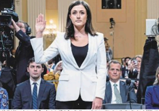
Cassidy Hutchinson is sworn in Tuesday to testify before the House select committee investigating the Jan. 6, 2021, attack.