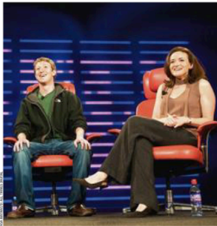
Sheryl Sandberg, with Meta Platforms CEO Mark Zuckerberg in 2008, shortly after she joined the company then known as Facebook, is stepping down as chief operating officer.

© 2022 Dow Jones & Company, Inc. All Rights Reserved.