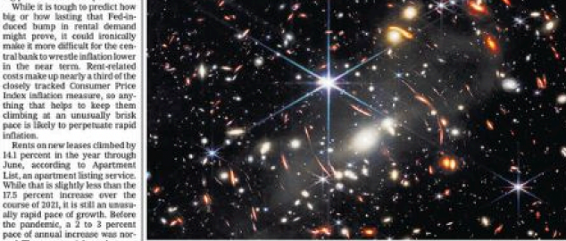
Galaxies in Our Eyes The Webb Space Telescope's infrared image of the distant universe was unveiled Monday. Page A18.