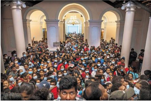
Thousands of Sri Lankans filled the official residence of Gotabaya Rajapaksa on Monday. He says he will resign Wednesday. Page A4.