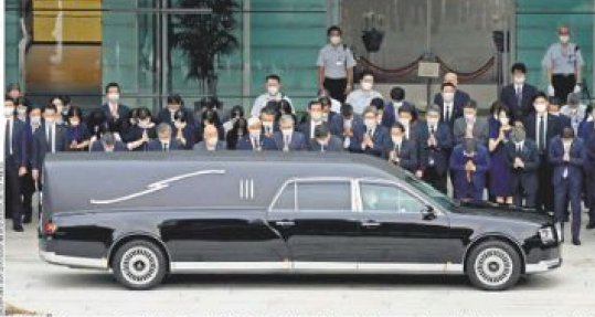
MOURNING: Japanese Prime Minister Fumio Kishida and other officials offered prayers alongside the hearse carrying the body of Shinzo Abe after his funeral on Tuesday. The former prime minister was shot and killed at a political rally on Friday.