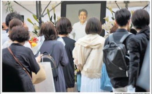
Japan Bids Abe Farewell Citizens offered flowers for ex-Prime Minister Shinzo Abe in Tokyo before his funeral on Tuesday.