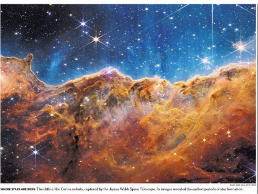
WHERE STARS ARE BORN The cliffs of the Carina nebula, captured by the James Webb Space Telescope. Its images revealed the earliest periods of star formation.

DOW JONES | Market Cap | MDAQD 152473 * 2.9% | STOXK 460 47.04 * 0.3% | 10-YR TREAS. @ 3.92% | VIX 25.95% | OIL 95.04 * $4.25 | GOLD 1922.30 * $6.70 | EURO 1.0609 | Yen 136.87