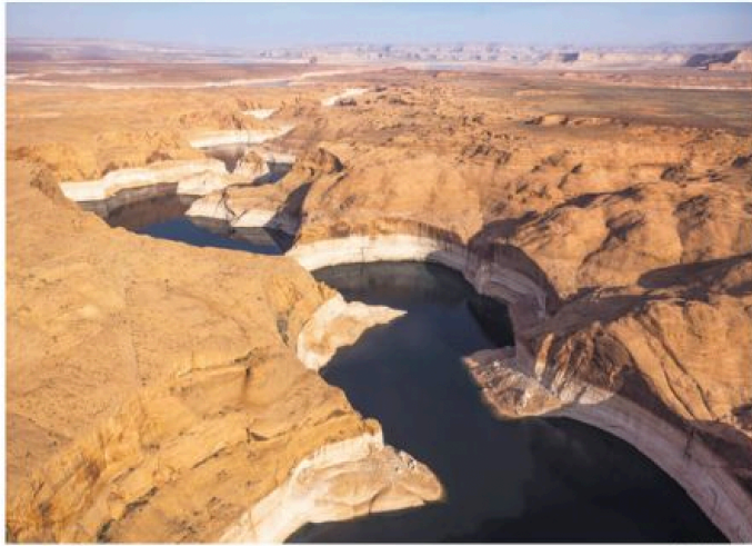
New water cuts aim to ease a crisis in the Colorado River and one of its reservoirs, Lake Powell, above, on the Arizona-Utah border.