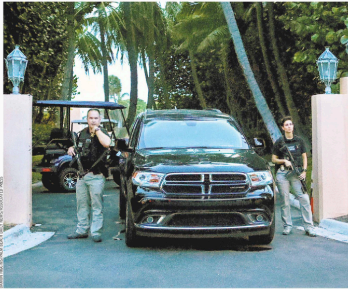
Secret Service agents stand at the gate of Mar-a-Lago after FBI agents searched the home of former President Donald Trump.