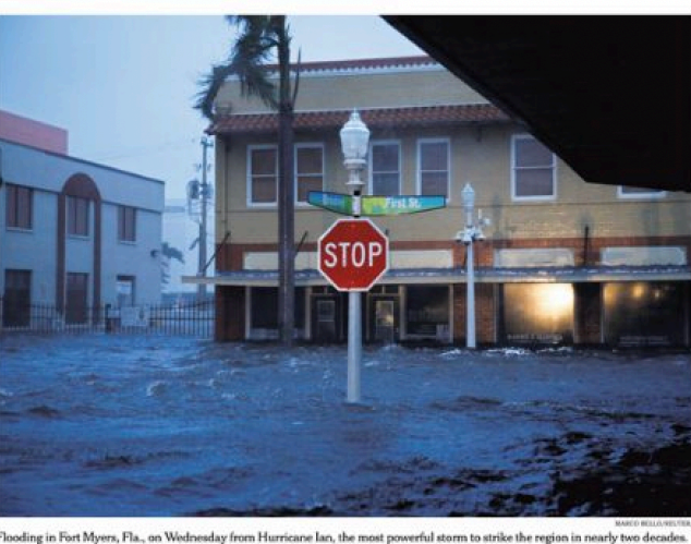
Flooding in Fort Myers, Fla., on Wednesday from Hurricane Ian, the most powerful storm to strike the region in nearly two decades.

National Edition Upper Midwest: Sunny. Cooler than average. High in 60s to lower 70s. Mostly clear tonight. Lows in 40s. Mostly sunny tomorrow and mild. Weather map appears on Page A14. Printed in Chicago $3.00