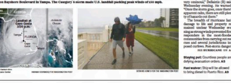
Fuel tanker: Ship will be allowed to bring diesel to Puerto Rico.