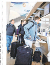
PERSONAL JOURNAL White House's new bid to clarify maze of airline fees faces rough landing. A11