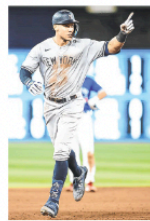
SPORTS Yankees slugger Aaron Judge hits 61st home run, tying AL record. A14